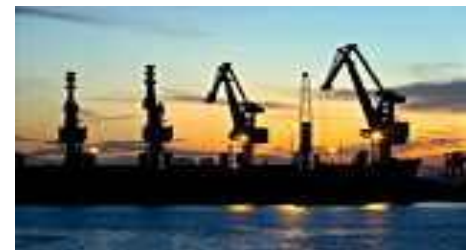
Marine Engine Lubricants

Oil analysis program that allows the follow up of lubricants in use, through elaborate oil sample analysis whose results can be availed in a short period using our well equipped Laboratory in our blending plant (OPSBA) dedicated exclusively for used oil analysis.